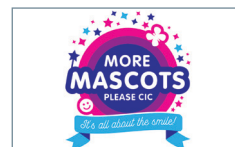
More Mascots Please!