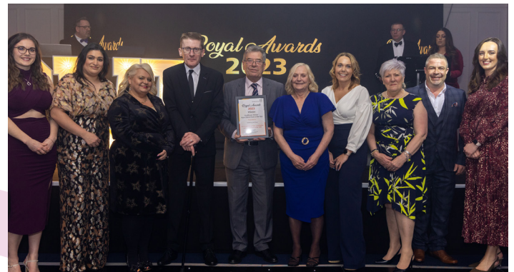
The Staff Wellbeing Team receiving their award

It scooped the Healthcare Heroes - Non-Clinical Team of the Year category with the Staff Wellbeing Team.