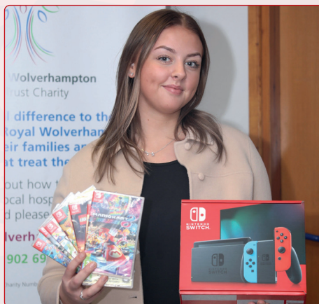
Dudley Building Society, Perton branch, wanted to make a difference to our youngest patients

and purchased a Nintendo Switch and games to help pass the time whilst receiving treatment.