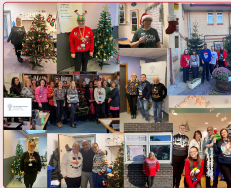
Staff took part in the annual Christmas jumper day raising an amazing £160.