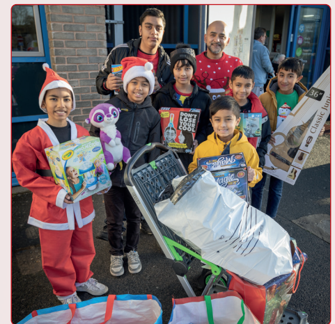
Hit The Dhol group ran it's annual toy drive and donated toys and instruments for our children's department and also our community clinic at the GEM centre. The children enjoyed dressing up as Santa's helpers on delivery day.

and purchased a Nintendo Switch and games to help pass the time whilst receiving treatment.