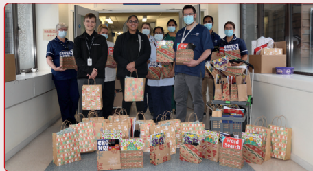
Collins Aerospace Wolverhampton pulled together to deliver 130 goody bags for our elderly care patients who would be spending Christmas Day in one of our hospitals. The goody bags were filled with treats including toiletries, socks, art therapy book and hand cream.