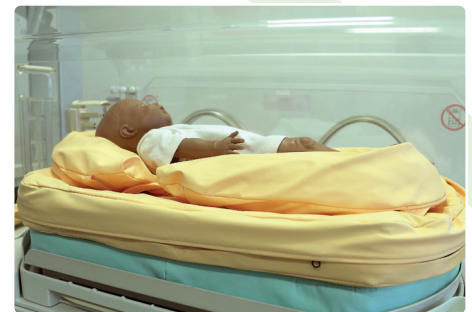
The Neo Mattress

specifically designed for neonates that have been compromised and are at high risk of skin breakdown.