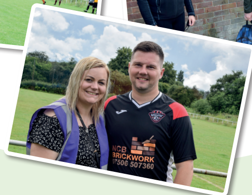
Photos taken during Harper's Charity Fun Day and Football Match