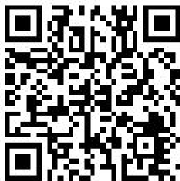
RWT Young Patients